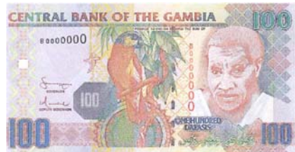
Size 156mm x 81mm Portrait Gambian Man