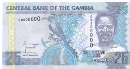
Size. 144mm x 75mm Portrait Gambian Man