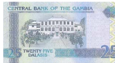
Main Colour: Blue Vignette State House