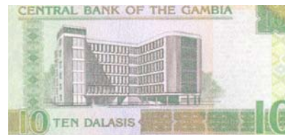
Main Colour: Green Vignette. Central Bank Building