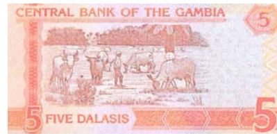
Main Colour. Red Vignette Cattle Farming/Tending