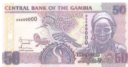
Size 150mm x 78mm Portrait Gambian Woman