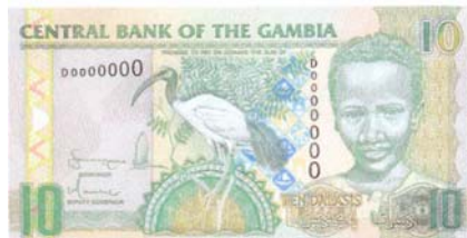
Size 138mm x 72mm Portrait Young Gambian Boy