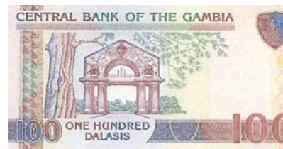
Main Colour Green Brown Vignette. Arch 22 Monument