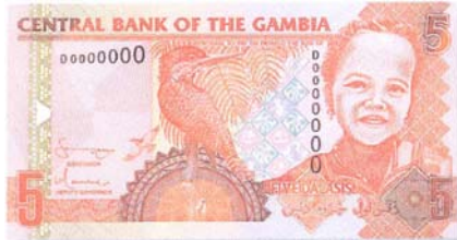
Size 132mm x 69mm Portrait Young Gambian Girl

The new design banknotes have the following appearance: